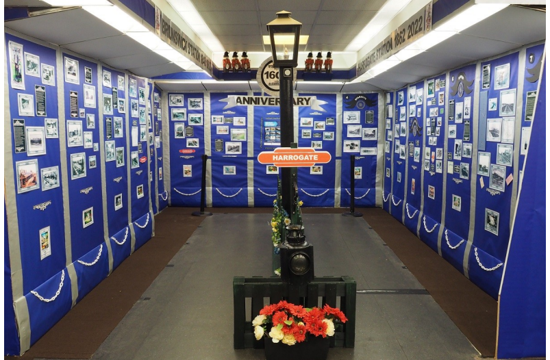
Part of the exhibition held in the former business space of the station concourse

As before, the exhibition will be free but donations to the railway's charity of choice, Cancer Research UK, will be welcome. Over £300 has been raised so far.