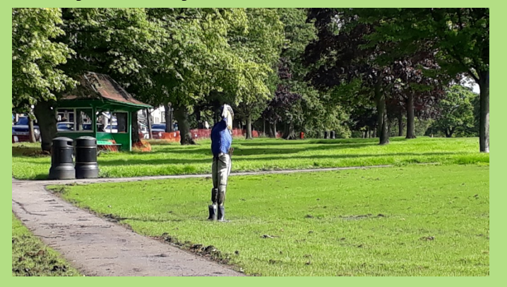
Scarecrow on the Stray 11 July 2020

Thursday 25th June will have passed by with little obvious significance.