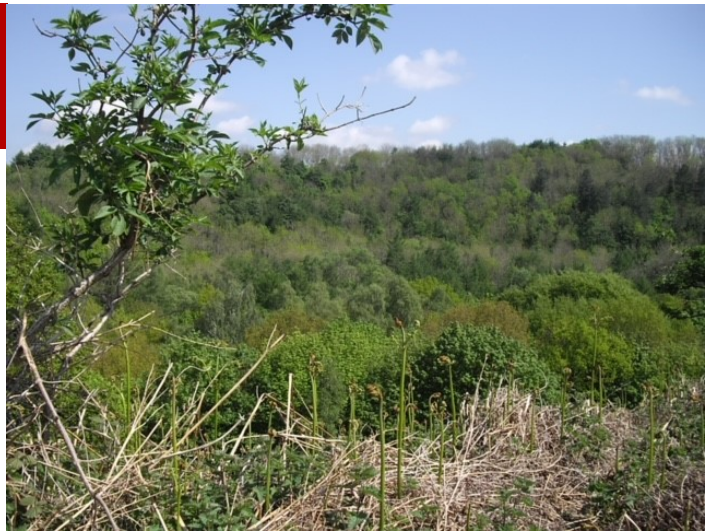
The wildness of Nidd Gorge

The Nidd Gorge Advisory Partnership was established between HBC, Knaresborough Town Council, Bilton Conservation Group, Knox Valley Residents Association Group, Knaresborough Nidd Gorge