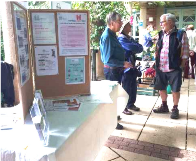
Below: our new bookmarks - a great success with visitors!