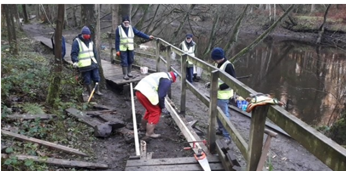
Volunteers laying a walkway in Nidd Gorge

We look forward to some form of normality returning in 2022.