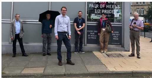
Above: meeting at Harrogate Station entrance on 7 July