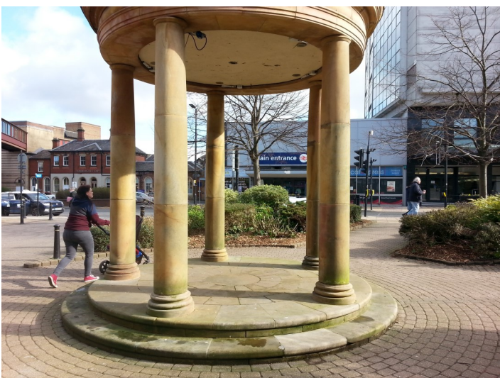
Below: Station Square. The neo-classical stone temple was originally intended to contain a sculpture or water feature

We published the Civic Society's response to the Station Gateway proposals in our May 2021 newsletter. Since then we have been in contact with NYCC and HBC officers and took part in a joint walk around the area of the project on 7 July.