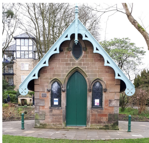
The Old Magnesia Well pump room

What of the future? Education of the Spa Heritage and history of the gardens is a particularly important part of what we do, something we share with the Civic Society. In a normal year there are nearly three and a half million visits to Valley Gardens with visitors from around the globe.