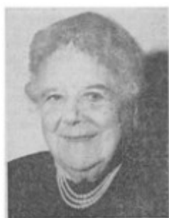
From British Medical Journal: Aug 24 1963

Documents relating to the AGM will be circulated to members separately.